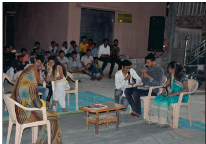
NSS Special Camp at Jasapur Dt. 25 to 31/03/2019