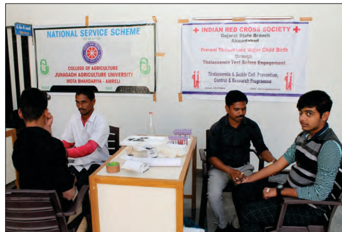
Thalassemia Camp at College of Agriculture, Mota Bhandariya Dt. 31/01/2018