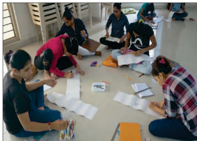
Slogan Writing Competition on Gandhi Jayanti Dt.26/09/2018