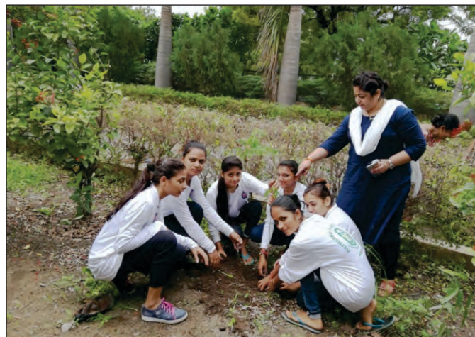
Tree Plantation Dt.27/07/2018

Special Camp: NSS Special Camp did not arrange by Polytechnic in Home Science, JAU, Amreli