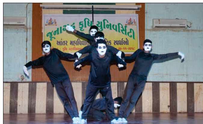
Inter College Cultural Competition Dt.20/11/2018