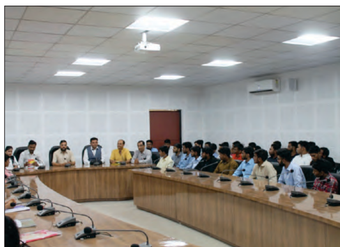
Campus Interview by Wilshire Pesticide & Chemical Ltd. Dt.30/03/2019