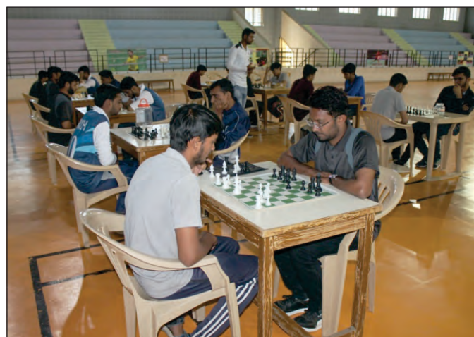
Inter College Chess, Cricket, Kho-Kho, Volleyball Dt.01 to 03-03-2019