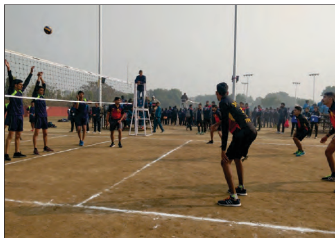
All India Inter Agricultural Universities Sports Meet at PAU, Ludhiana Dt.2 to 5/01/2019