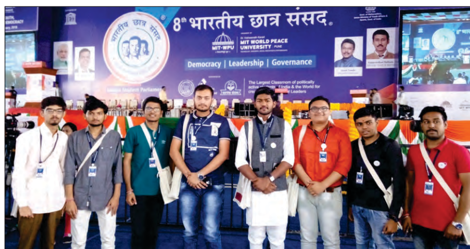
Participation in Youth Parliaments Dt.28/01/2019