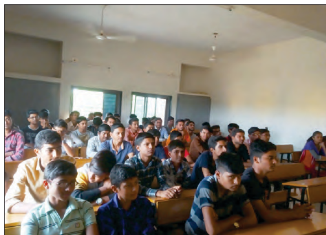
Celebration Dr. B. R. Ambedkar Jayanti Dt.16/04/2018