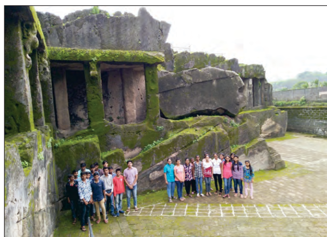
Visit of Historical Place Dt. 03/08/2018