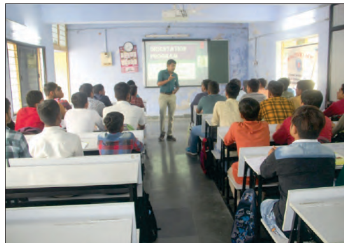
NSS Oriantation Programme Dt.07/08/2018

Special Camp: NSS Special camp was not arranged by Animal Husbandry, Junagadh: