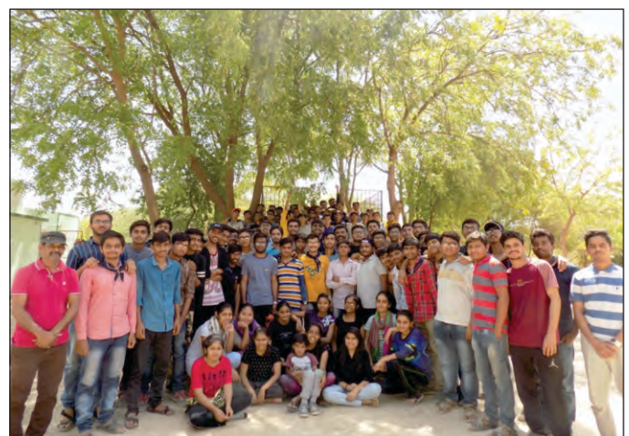
NSS Special Camp at Dungarpur Dt. 19 to 25/03/2019