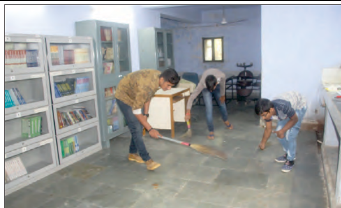
Cleaning under Swachchta Pakhwada Dt. 01 to 15/08/2018