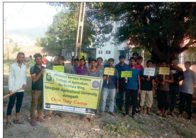
Cleaning Activities on Gandhi Jayanti Dt. 02/10/2018