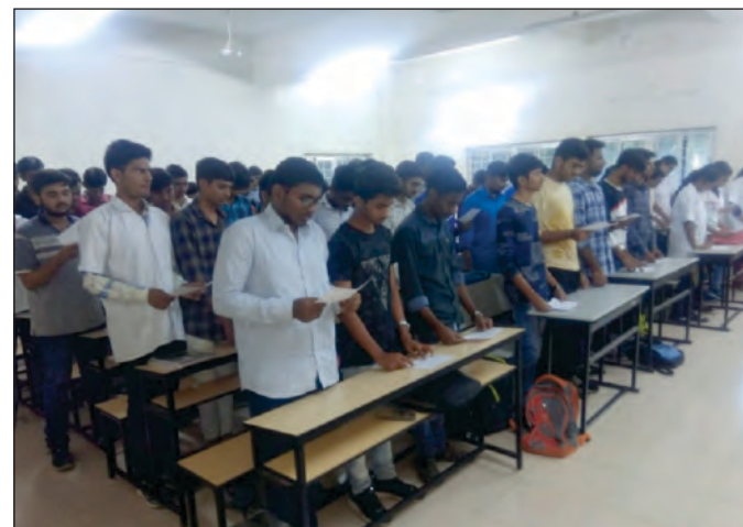
Celebration of Vigilance Awareness Dt.03/11/2019