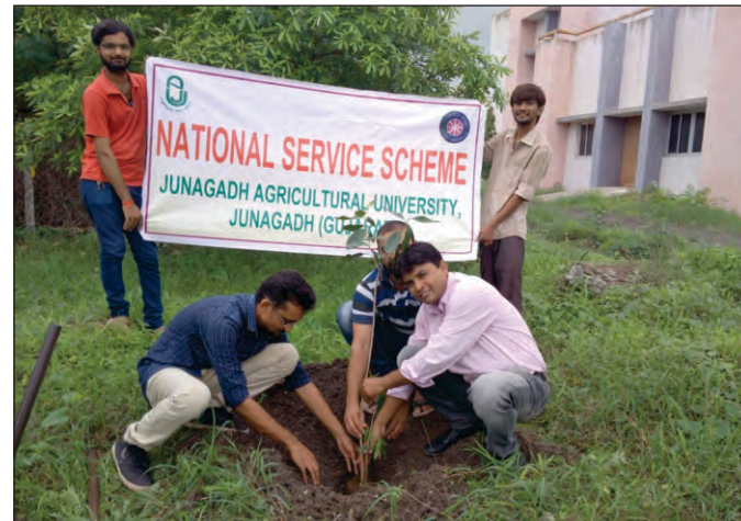
Tree Plantation Dt. 27/07/2018