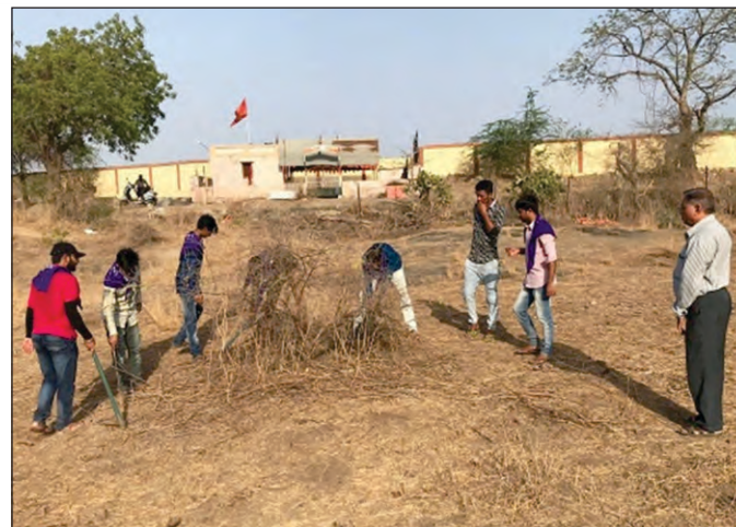
Cleaning of Check Dam Dt.01/06/2018