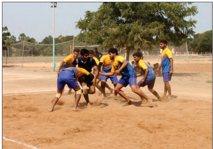
Inter College Volleyball, Basketball, Kho-Kho, Kabbadi, Table Tennis, Badminton Dt. 10 & 11/10/2018