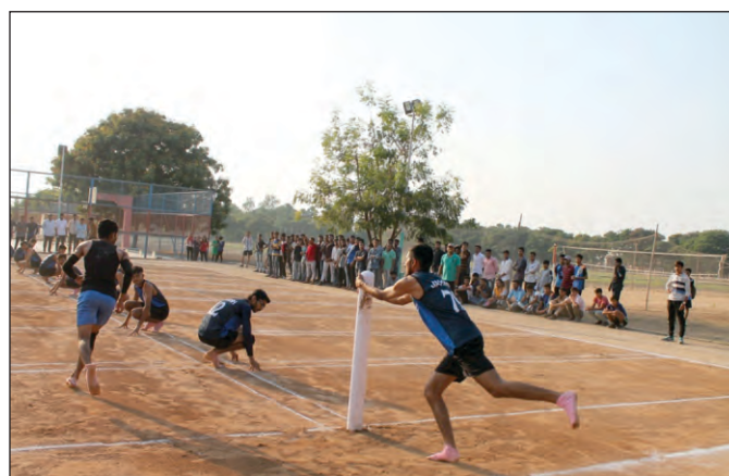
SAU Kabaddi Kho-Kho & Table Tennis Dt.01/11/2018