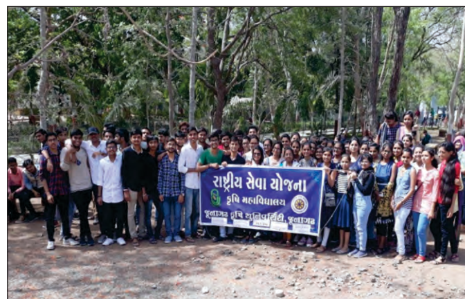
Visit to Nature Education Site at Sasan Gir Dt.19/05/2018