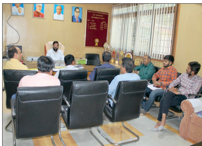
Placement Cell Meeting Dt.28-03-2019

to maintain data base of the students of outgoing batch and to keep in constant touch with various employers for conducting campus interview for providing better placement opportunity. The Directorate also arrange special lectures and short term training on Personality Development and life skills, communication skills, Leadership development resume preparation for the students of all the faculties, so as to built the self esteem of the students which enable them to face the challenges with confidence.