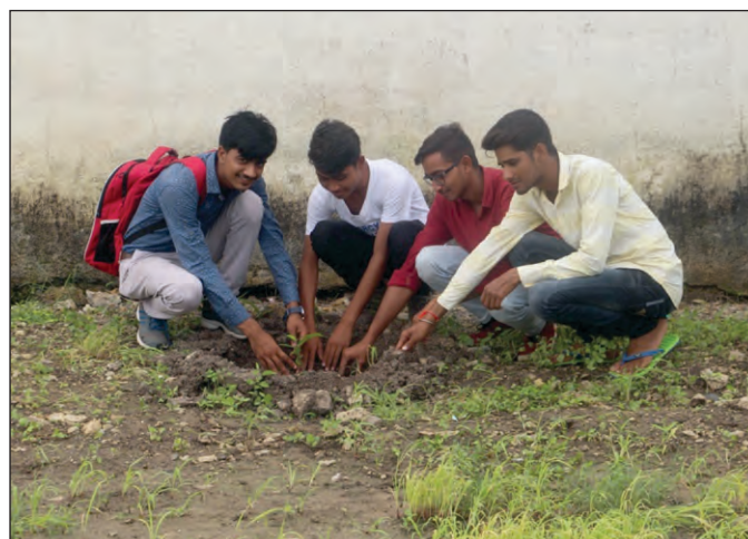
Tree Palntation Dt. 27/07/2018