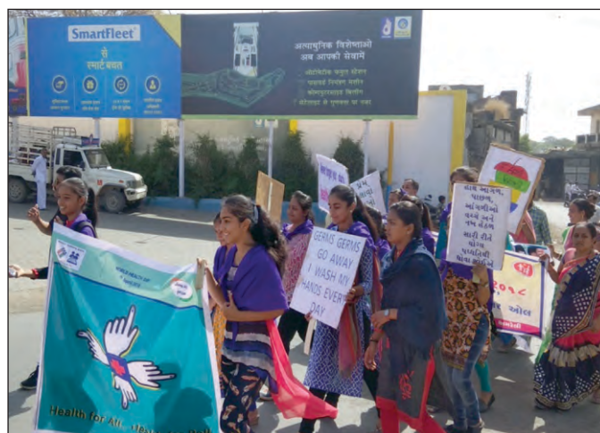
Health Awareness rally Dt.07/04/2018