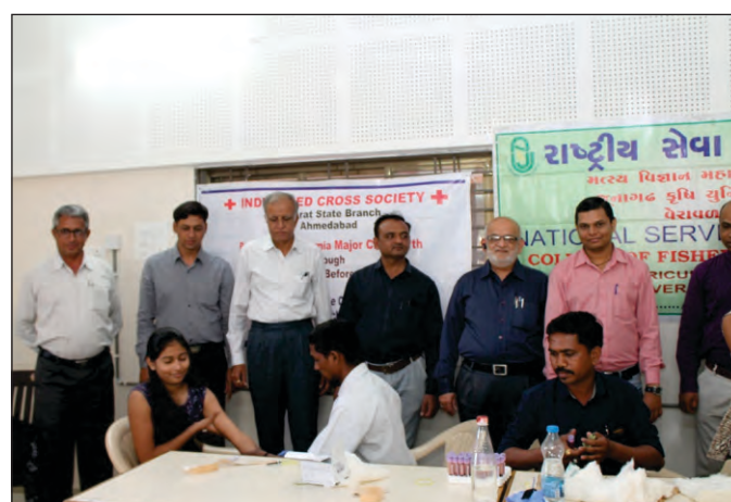
Thalassemia Camp at College of Fisheries, Veraval Dt.30/01/2018