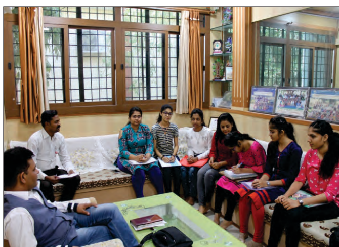
Campus Interview by Wilshire Pesticide & Chemical Ltd. Dt.30/03/2019