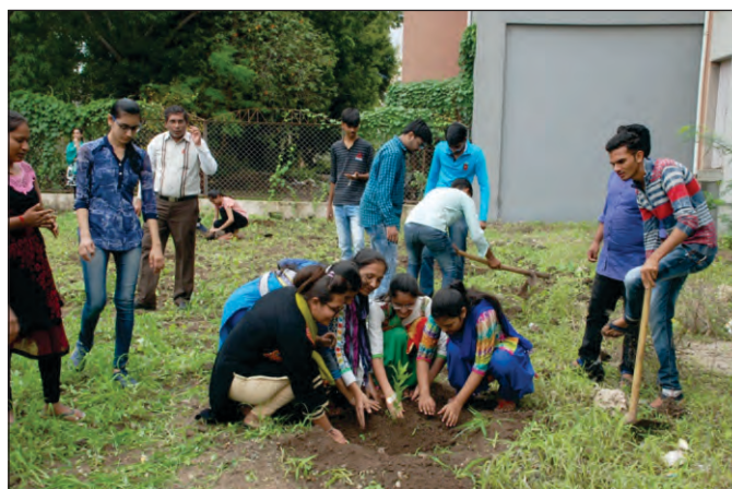
Tree Palntation Dt. 26/07/2018