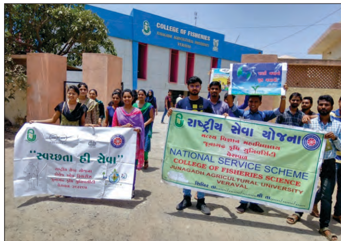
Awareness for Water Storage & Conservation Dt. 30/04/2018