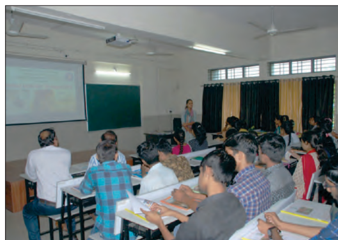
Celebration of World Lion Day Dt. 10/08/2018