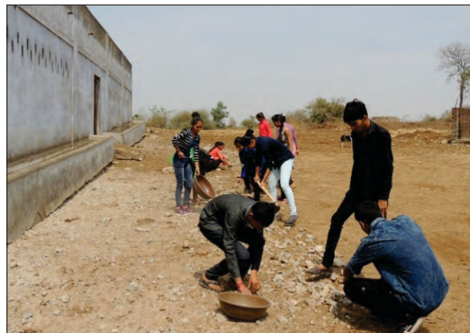
NSS Special Camp at Targhadiya Dt. 16 to 22/03/2019