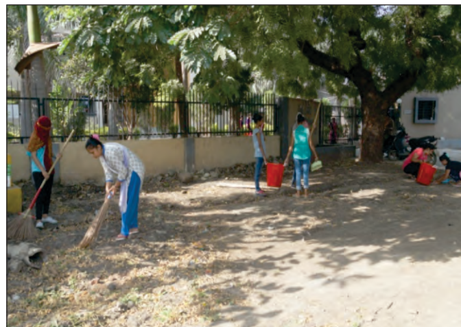
Cleaning under Gandhi Jayanti Celebration Dt.02/10/2018