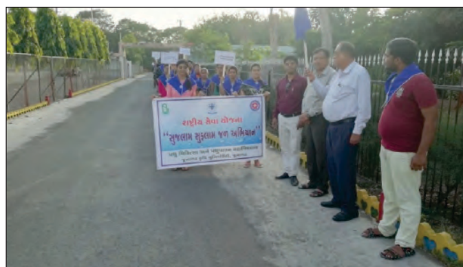
Awareness for Water Storage &amp; Conservation Dt. 30/04/2018