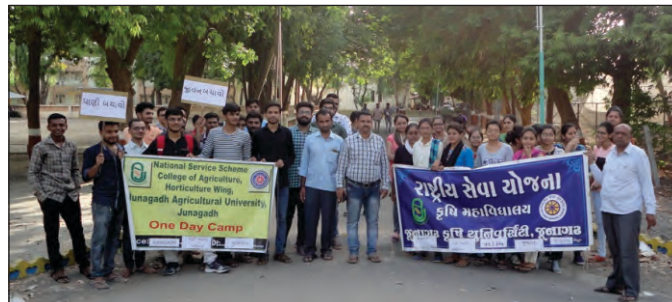
Awareness for Water Storage & Conservation Dt.30/04/2018