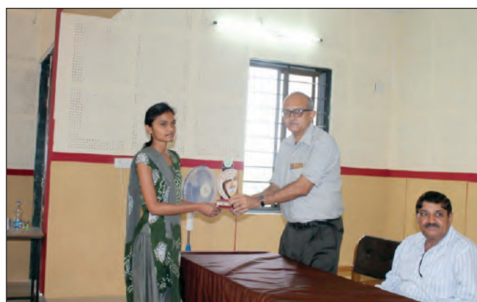
Inter College Literary Competition Dt.12/10/2018