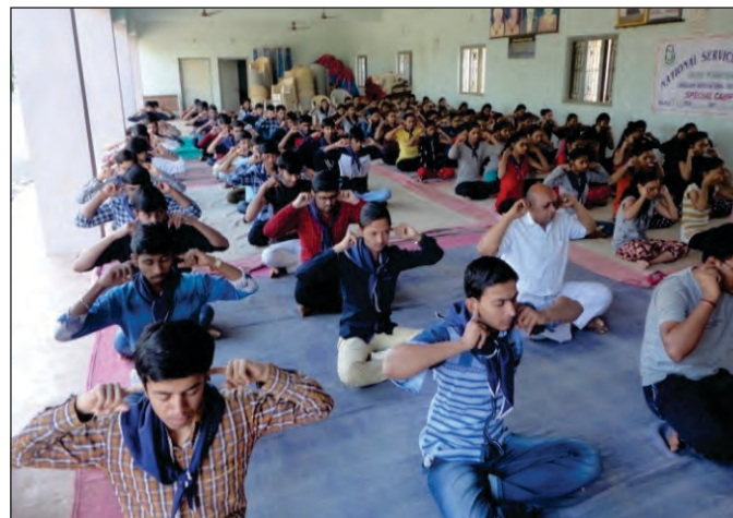
NSS Special Camp at Itali Dt. 17 to 23/03/2018