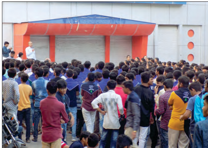
Prabhat Feri Dt. 02/10/2018