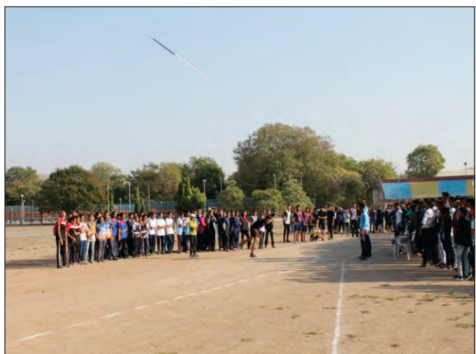
Inter Polytechnic Athletics Dt. 01 & 02/02/2019