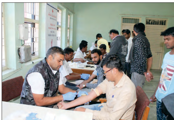
Thalassemia Camp at Junagadh Dt. 30 & 31/01/2019