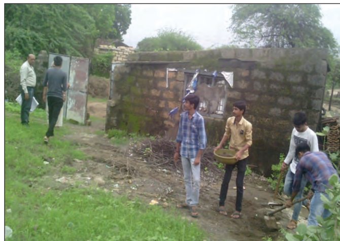
Swachhata Abhiyan Dt. 26/07/2018