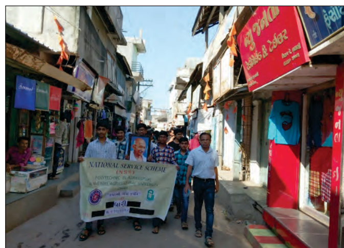
Prabhat Pheri on Gandhi Jayanti Dt.02/10/2018