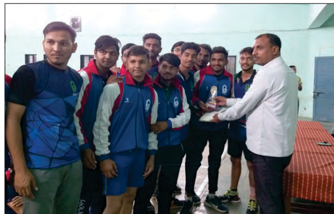
SAU Volleyball & Table Tennis at Navsari Agricultural University, Navsari Dt.20/11/2018