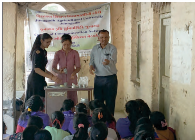
NSS Special Camp at Linepara Dt.20 to 26/03/2019