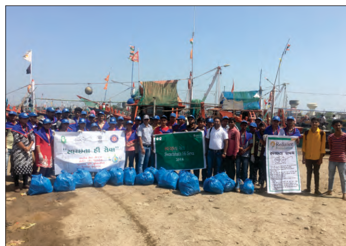
International Coastal Clean Dt. 29/09/2018