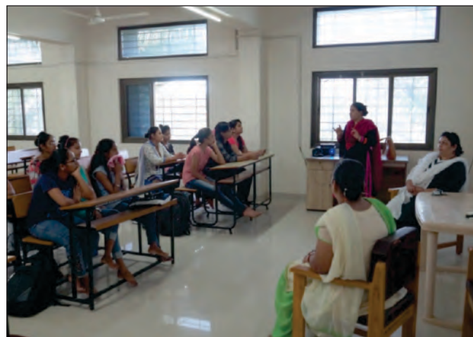
Lecture on Celebration of Gandhi Jayanti Dt.25/09/2018