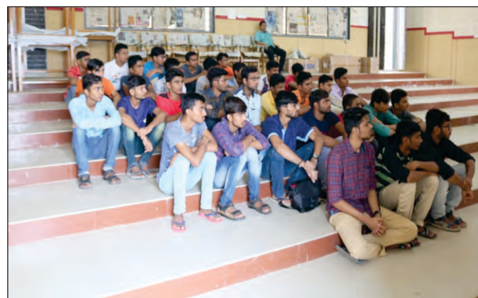
NSS Orientation Programme Dt.04/08/2018