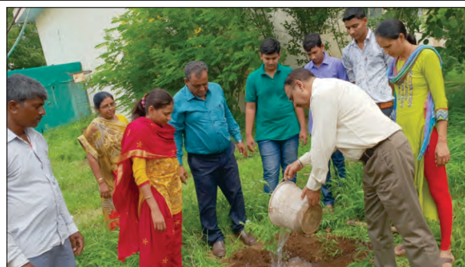
Tree Plantation Dt.15/08/2018